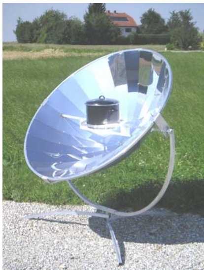
Noble design, operatively sound and greatest possible control comfort.

Solar cooker Premium14 Order-No.: 110-0007 359,00 EUR