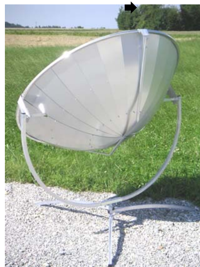
Back view of the solar cooker. The reflector is protected from damage by a safety roll bar (see arrow)

Technical data: Reflector diameter = 140 cm Output = 700 Watt at clear sky (1 litres of water are boiled within 9 minutes.) Weight, packing included: 18,5 kg Packing dimensions: 117 x 55 x 10 cm