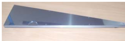
Set of reflector sheets SK14, length 86 cm