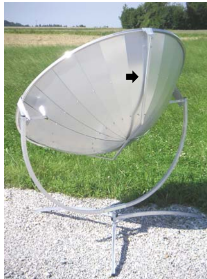
Back view of the solar cooker. The reflector is protected from damage by a safety roll bar (see arrow)

The rack is made of zinc-plated steel and the rest is made of aluminium. The cooker kit is completely equipped thus integrating the comprehensive installation manual and cooking instructions.